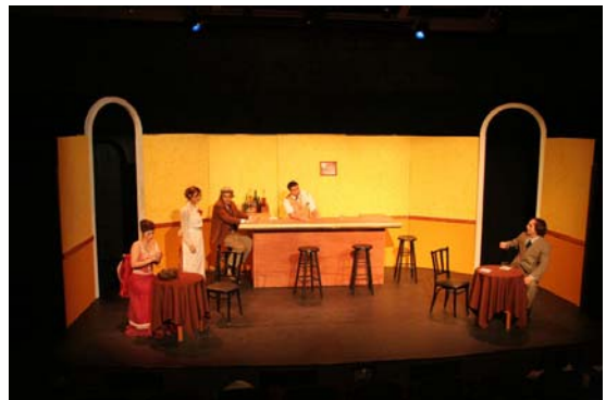
A scene from “Picasso”