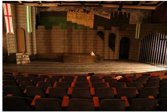
Test of lighting concept on the set for the finale