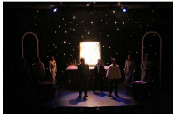
Finale from “Picasso”

INDUSTRIAL EXPERIENCE: Technical Section Supervisor: ExxonMobil Chemicals – Baytown Chemical Plant May 2007-Present – Baytown, TX 77520