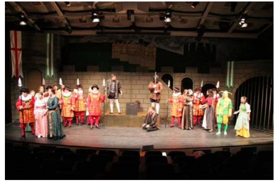
Act One Finale